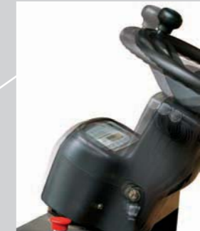
The adjustable steering Column ensure a comfortable working position.

CURTIS or DANAHER MOTION made high-frequency controller incorporates a powerful microprocessor together with MOSFET power electronics.