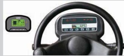
New Multi-Display employed full dotted LCD is located on the steering column to improve visibility and manipulate-ability.

CURTIS or DANAHER MOTION made high-frequency controller incorporates a powerful microprocessor together with MOSFET power electronics.